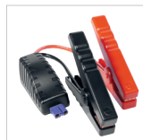
Smart jumper cable