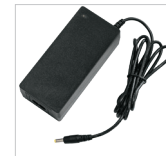
230 V charger unit and mains cable